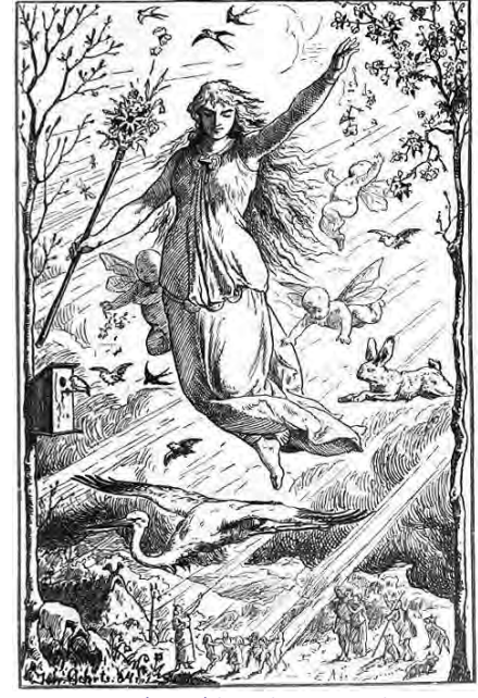
Ostara (1884) by Johannes Gehrts