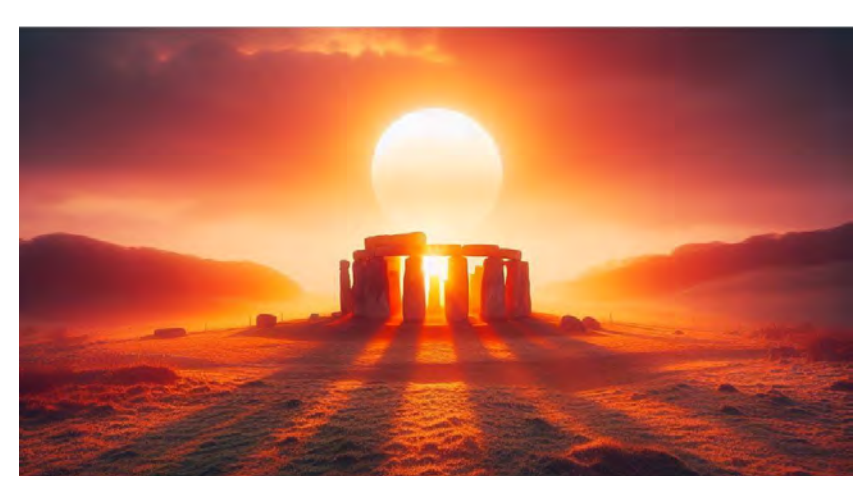
The 2024 Spring Equinox will Take Place on March 19

"From a Masonic perspective, this equinox can be likened to the measuring of our point within a circle. The plumb line achieves a center point in its swing, representing both our vertical and rotational motion around our axis." The Masonic Equinox, March 20, 2010 by Masonic Traveler