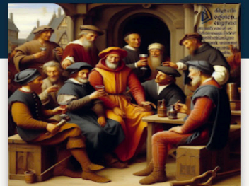
M A R 11 Fellowship

Brethren, please join us for the George Washington Oratorical Contest. Don't miss out on this opportunity to hear heartfelt and amazing speeches from the youth of the community. Doors open at 9:00 am.