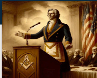
M A R 7 George Washington Oratorical

Brethren, please join us for dinner at 6:30PM and our Stated Meeting (monthly business meeting) beginning at 7:30 PM. We look forward to seeing you. Doors will open at 6:00 PM for fellowship.