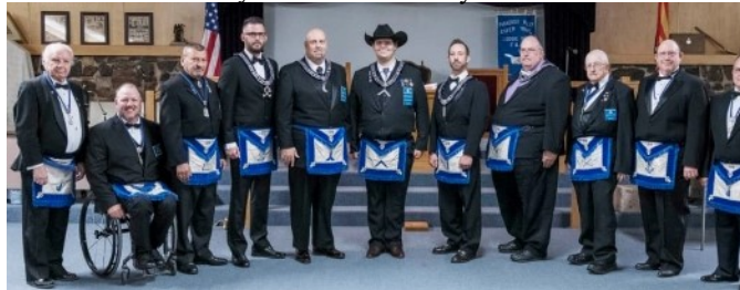
The Masonic Family at Paradise Valley Silver Trowel #29

To place YOUR business card in the Trestle Board, please contact the Secretary! If your card appears blurry, PLEASE submit a new one ASAP. THANKS!